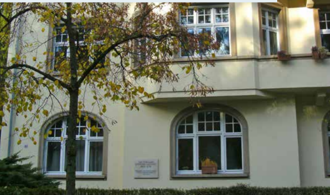
49. Residence of Prof. Husserl, Lorettostraße 40

Today, the municipal homeless shelter, the residence for people with disabilities and the large glass hall of the former restaurant, and today's forestry science research institute are housed here.