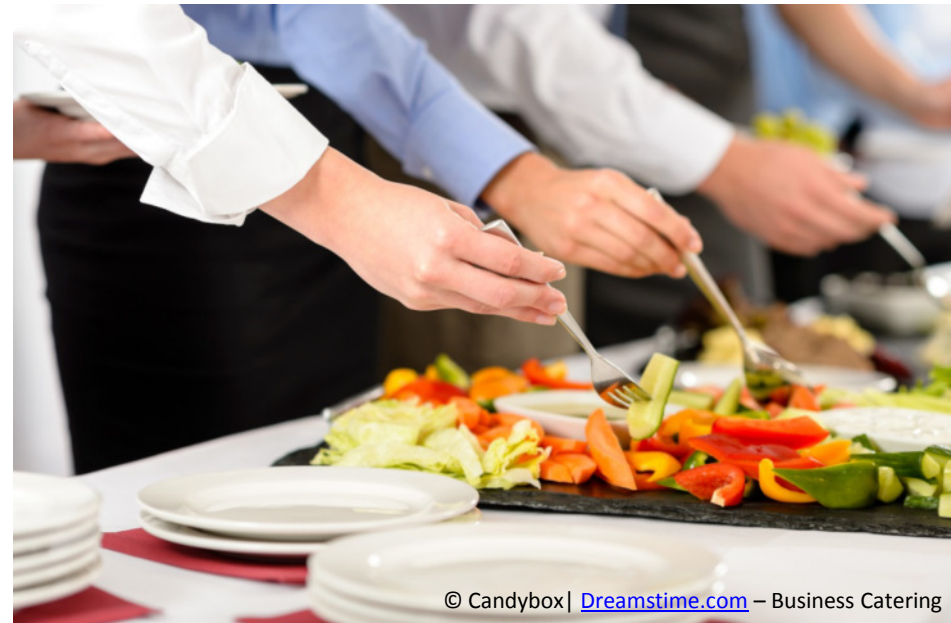
© Candybox | Dreamstime.com – Business Catering