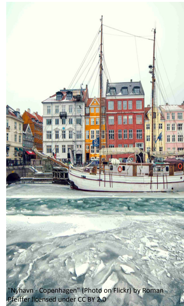
"Nyhavn - Copenhagen"