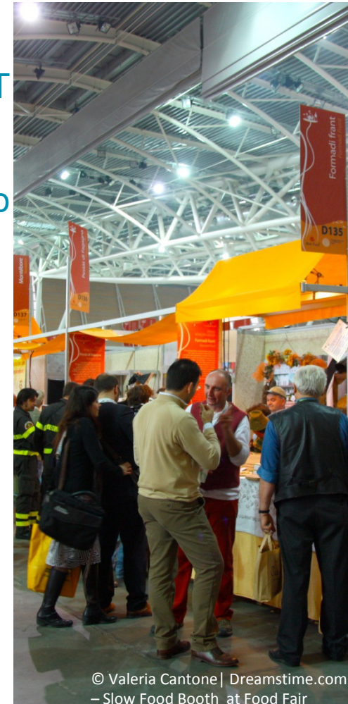
Slow Food Booth at Food Fair

http://www.sustainable-catering.eu/actions/city-interest-group/