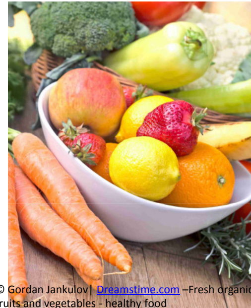
Fresh organic fruits and vegetables - healthy food