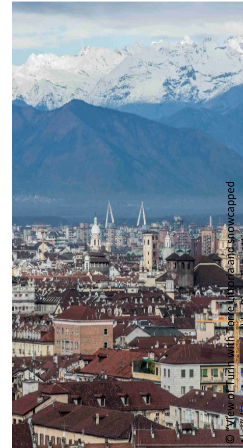
© "View of Turin with Torre, Torino and snowcapped Alps" (Dreamstime.com) by Piero Cruciatti